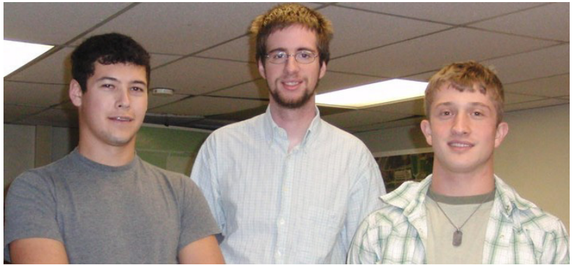
2009 RIT Students

The teams meet "face to face" using Skype (webcam on-line) "live". In eight months east & west students' collaborative effort will produce an AROHE website and provide mentoring and cultural exchange among the students and AROHE leaders.