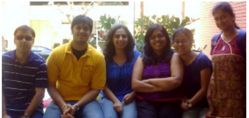
2009 USC Students