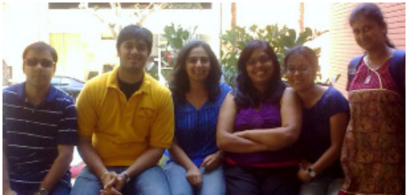
2009 USC Students